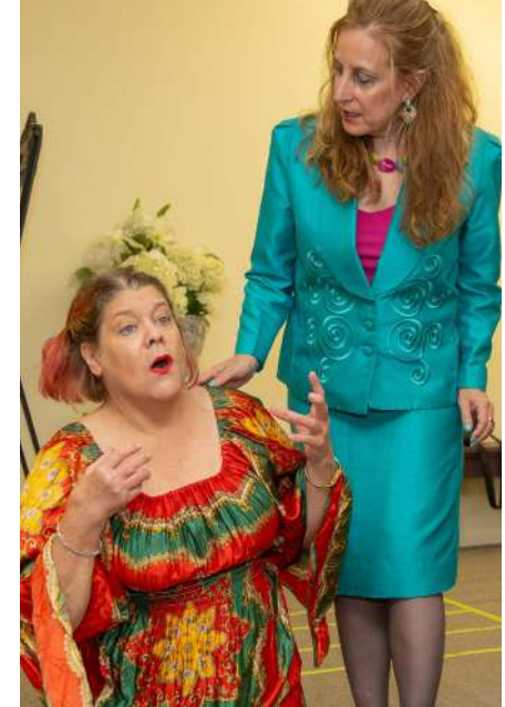
Hair styling by Cheree Lacassie - Glenfield Hair Design