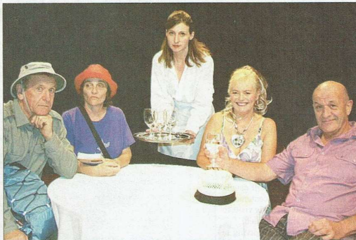
Four flat whites...just the tonic for winter evenings