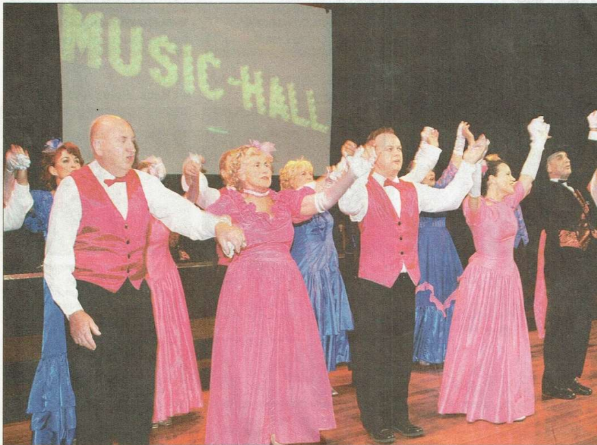
Dancing the night away...the MUSIC HALL cast