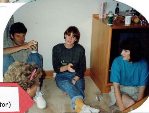
*"Music Hall" 1991 Company Theatre. (Musical Director)