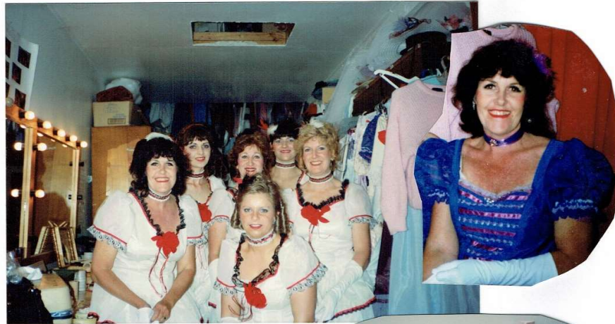
"MUSIC HALL" 1991