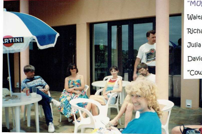
"MUSIC HALL" on tour