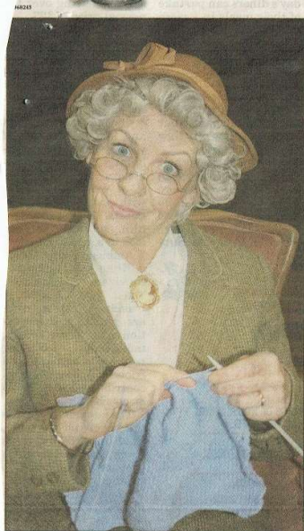
Inquisitive neighbour: Miss Maple knits the plot together.